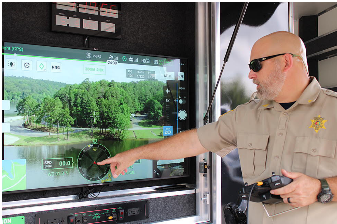
Instructor on a training site demonstrating how to use the drone at a WOLF workshop.