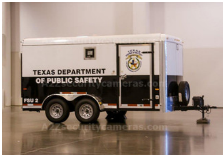
Example Image of Trailer Size