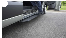
Running Boards – Extended Length