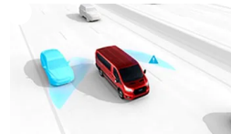
Blind Spot Assist 1.0